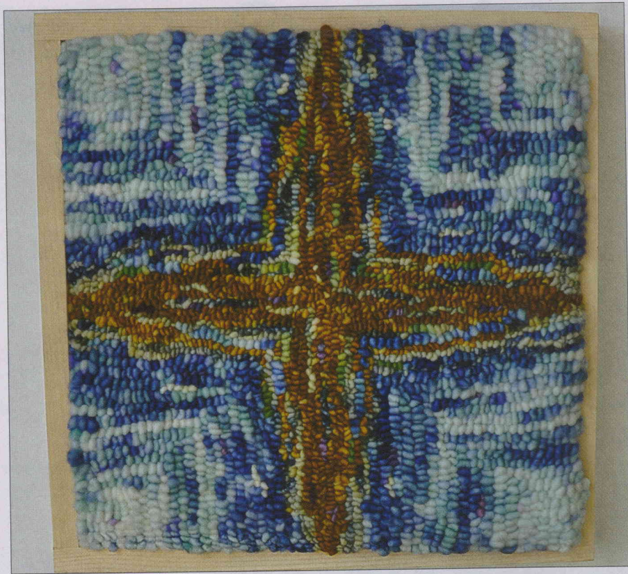
Prairie Crossroads , 14" x 14", hand-dyed merino on burlap. Designed and hooked by Gwen Dixon, New Brunswick, Canada, 2024.