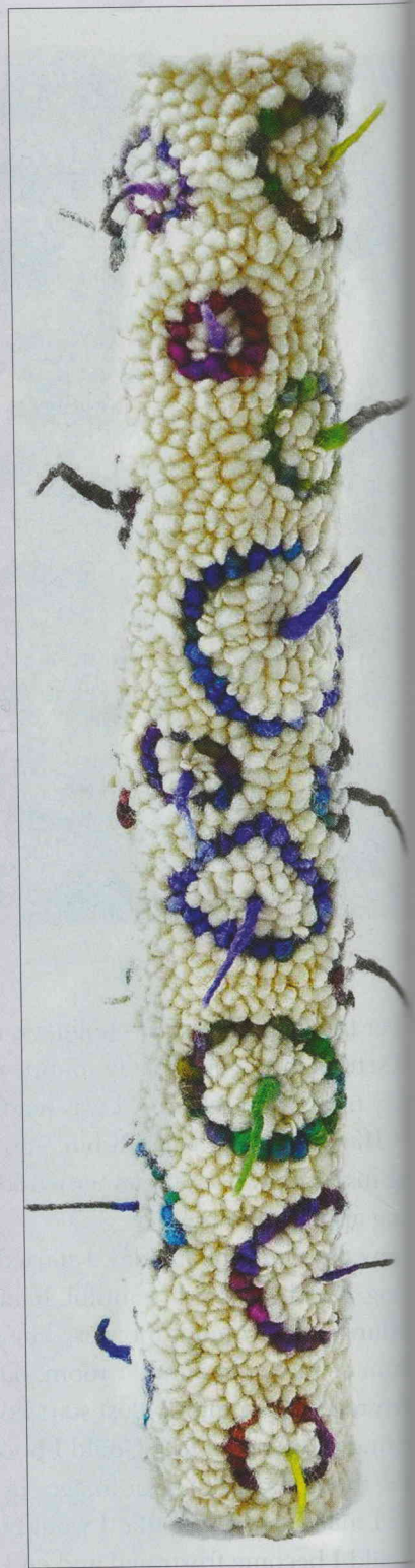
The Tube , 3" x 18", hand-dyed merino on burlap. Designed and hooked by Gwen Dixon, New Brunswick, Canada, 2023.